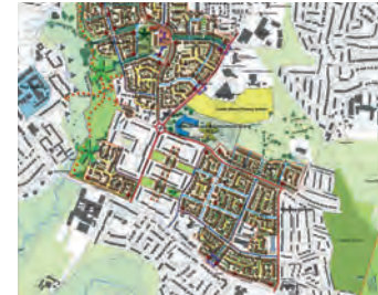
WEHM Urban Regeneration Coventry Consortium – Bovis Homes, Keepmoat & Westbury Partnerships (BKW)