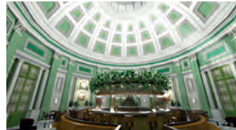
The Rotunda Cheltenham The Ivy Group