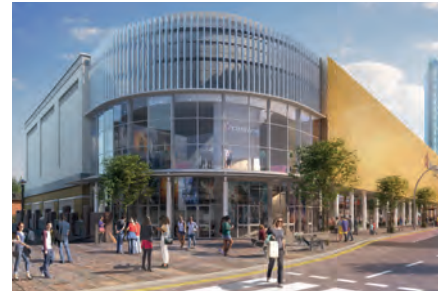
iScene Leisure Complex Ilford Legal & General