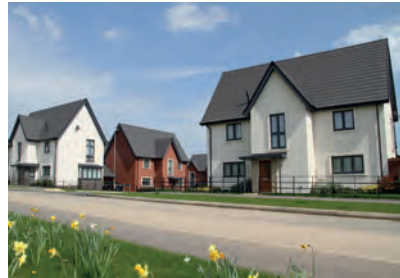
Monksmoor Farm Daventry Crest Nicholson