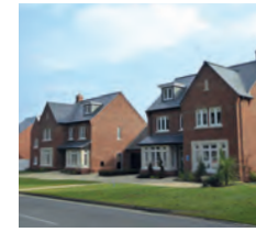
Heyford Park Oxfordshire Dorchester Group