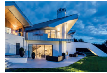
Harford Manor Estate Windsor QUADA Limited