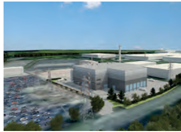
Hams Hall Distribution Centre Birmingham Rolton Kilbride