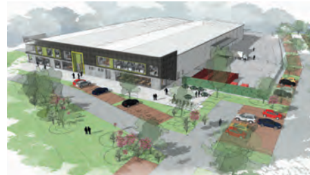
Create Yorkshire Yorkshire Makin Enterprises