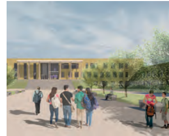
Binfield Learning Village Bracknell Made on behalf of Bracknell Borough Council