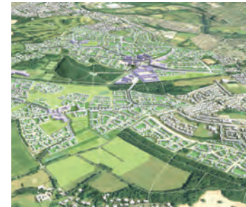
Plasdwr Garden City North West Cardiff Redrow Homes