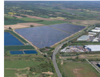
Deeside Weighbridge Road Atem Solar Limited