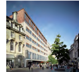
Church Street - Aparthotel Liverpool Quest UK Aparthotels