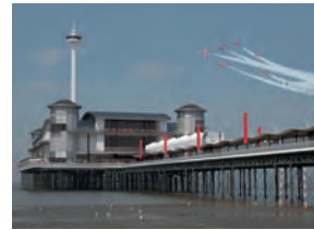
Weston-super-Mare Grand Pier Grand Pier Limited