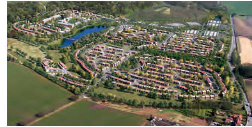
Thoresby Colliery Nottinghamshire Harworth Estates